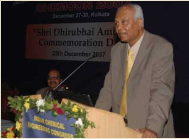
Padma Shri Dr. R.A. Mashelkar