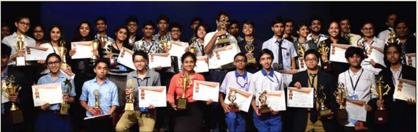
The winners on the stage