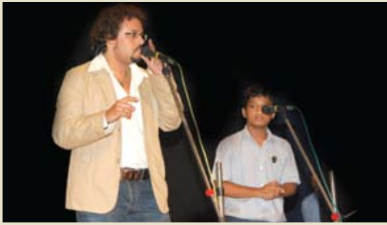
Pandit Bickram Ghosh