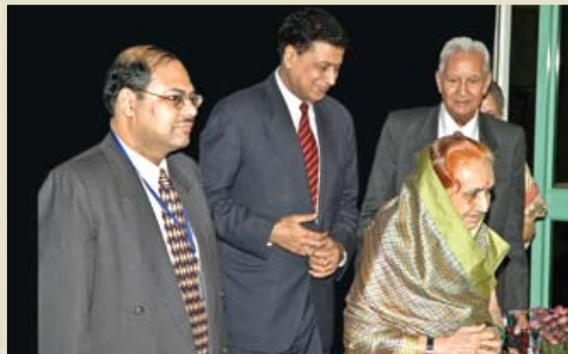
Shri Basant Kumar Birla