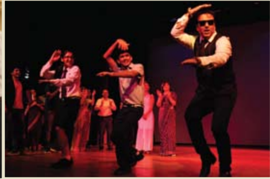
Mr. Govind Arun Ahuja (Govinda)