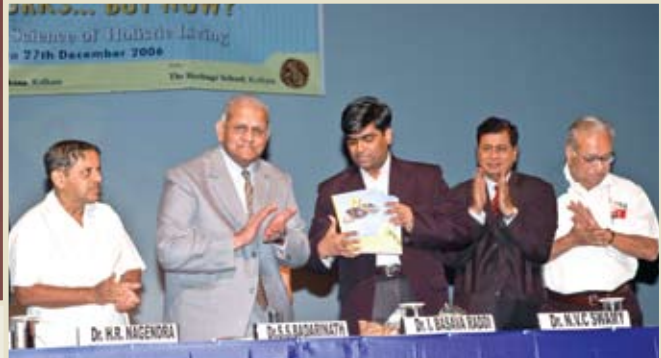
Padma Shri and Padma Bhushan Dr. Sengamedu Srinivasa Badrinath