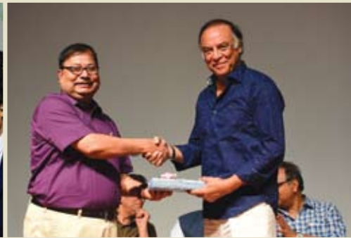
Mr. Barun Chanda