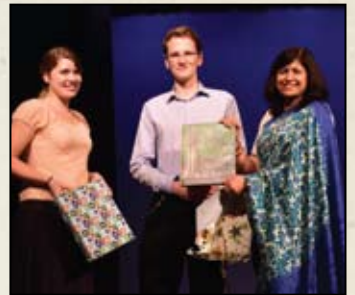
Students of German Sophie School, Wenningson during the exchange programme