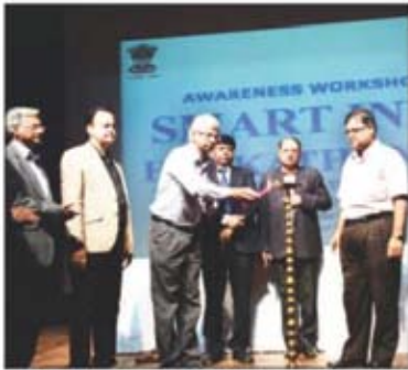
इस प्रतियोगिता में कार्यक्रम का हिस्सा लेना चाहिए। यही प्रतियोगिता में विजया लेने व प्रोजेक्ट जमा करने की अंतिम तिथि 20 जनवरी है। इस सेमिनार में राज्य के 600 छात्रों ने विजया लिये।