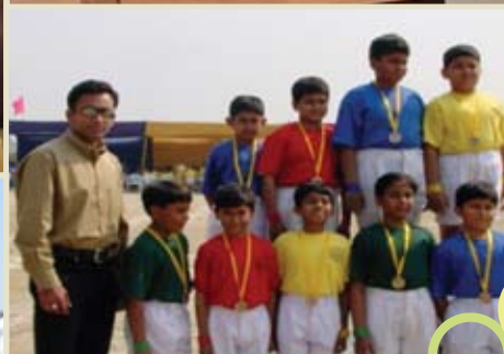
Eminent Cricketer Mr. Saba Karim