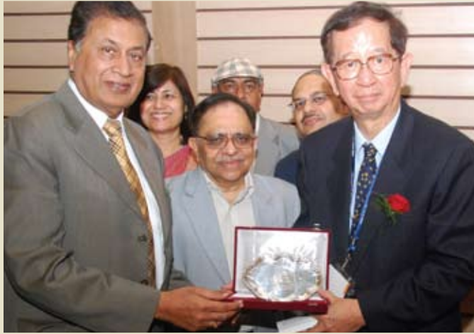
Nobel Laureate Prof. Yuan Tseh Lee