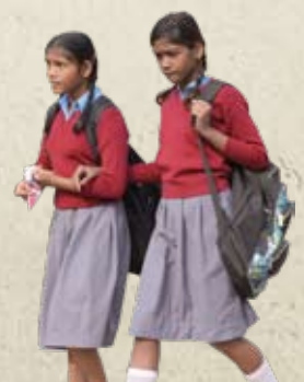
Nearly 1200 children from Jyotirmoy Club participated in an Annual Picnic organised at THS on 18 th Dec '16