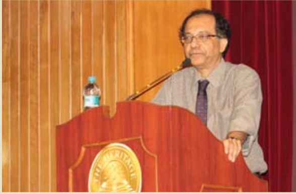
Dr. Kaushik Basu, Senior Vice-President & Chief Economist of World Bank