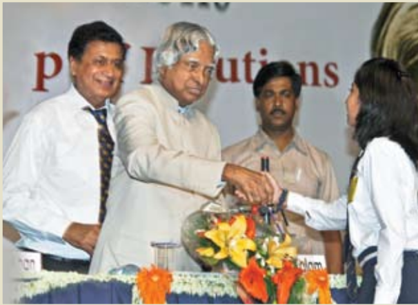
Late Bharat Ratna Dr. A.P.J. Abdul Kalam