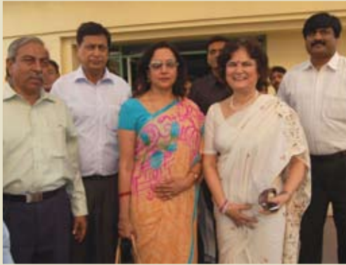
Ms. Hema Malini