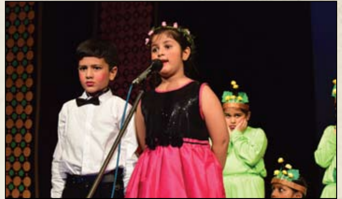
The event was held on 5 th & 6 th October for the Junior & Middle School students respectively