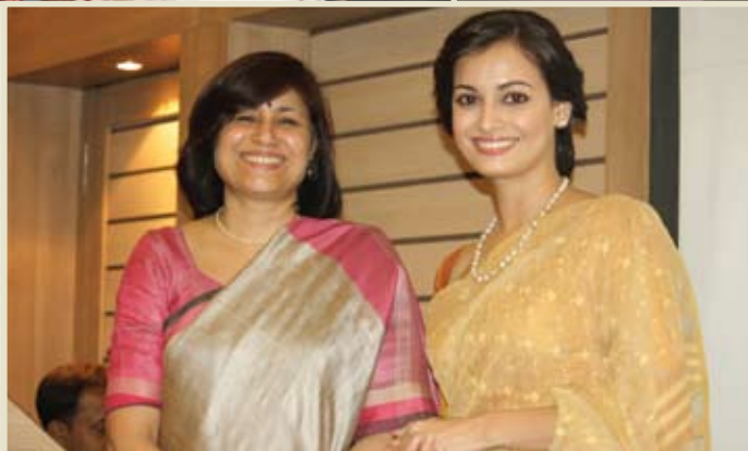
Ms. Dia Mirza