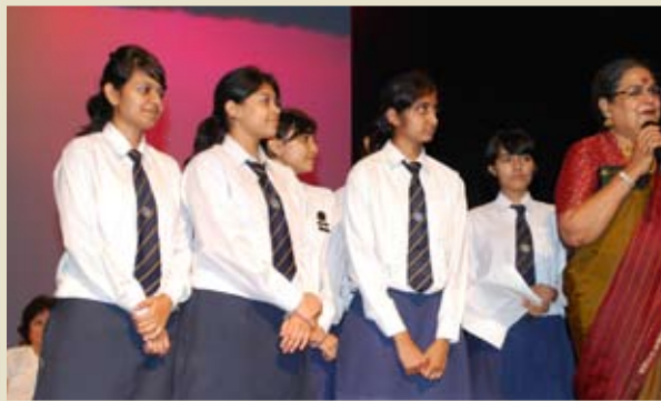
Ms. Usha Uthup