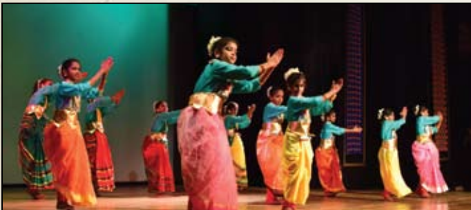
Students of Suryakiran showcased their talent for the first time by performing a dance item during the Junior School Concert