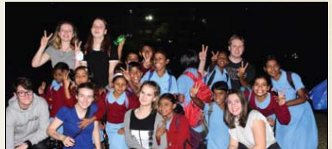
Seven German students flew down to Kolkata specifically to teach the students of Suryakiran. They were very impressed with the type of social endeavors of KBT.