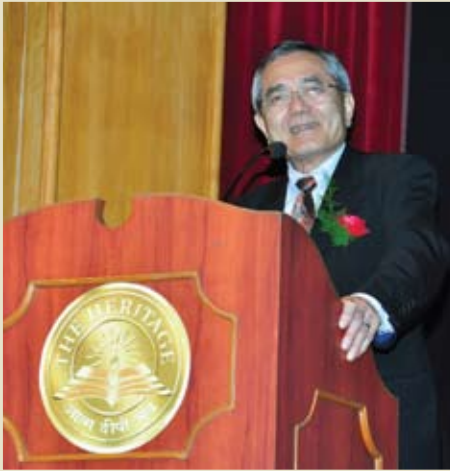
Nobel Laureate Prof. Ei-ichi-Negishi

In this special section we have meticulously compiled eminent dignitaries who visited and encouraged us in our 15 year journey. We are indeed immensely grateful to them.