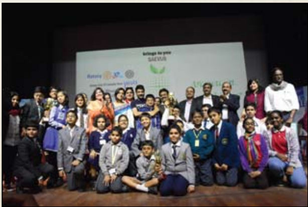
The winners on the dais

Rotary Club of Calcutta Yuvis and Inner Wheel Club of Calcutta Metro Maidan in association with NGO Saevus the country’s foremost nature and wildlife magazine supported by The Heritage School hosted a School Based Nature Quiz on environment involving kids of standard V to VII from about 50 prominent schools of Kolkata on 10th of Dec. ’16. This Annual Quiz is an all India event and is held in about 20 cities. THS students being the 2 nd runners-up brought laurels to the institution. Eminent actor Prosenjit Chatterjee was the Chief Guest during the Award Distribution Ceremony.