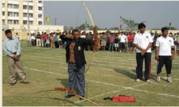
Padma Shri Mr. Limba Ram