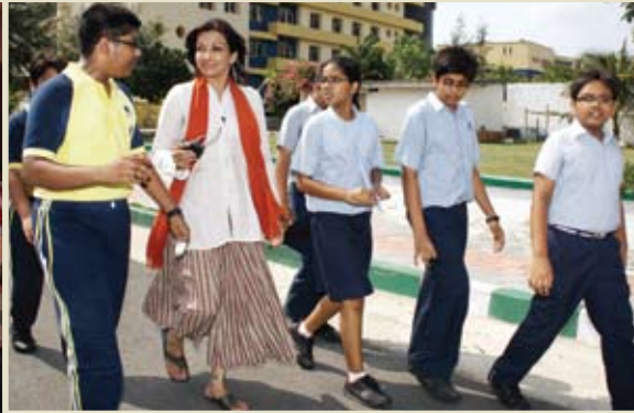
Padma Bhushan Ms. Mallika Sarabhai