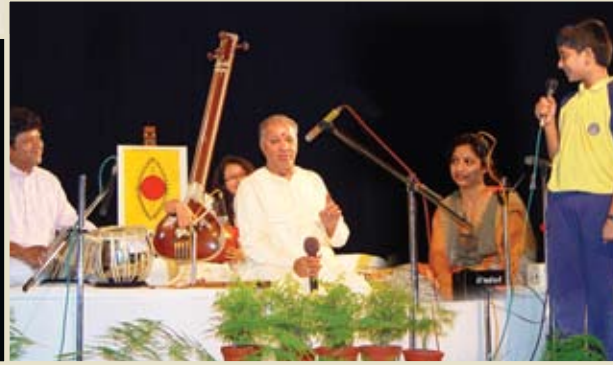
Pandit Hari Prasad Chaurasia