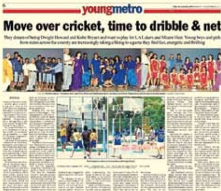
youngmetro Move over cricket, time to dribble & net They aren't being Dwight Howard and Kobe Bryant and want to play for LA Lakers and Miami Heat. Young boys and girls from across the country are increasingly taking a liking to sports like basketball, netball, and badminton.

The two-day meet also saw a business plan competition, where five city colleges took part. Each participating college — St. Xavier's College, Bhawanipur Education Society, JD Birla Institute of Management, IIPM and Heritage Institute of Technology — were assigned a mentor company. These companies, like Introssoft Technology Group, Anderson Printing House, O'Nergy and Bengal Shristi, helped the students come up with unique and sustainable business plans.