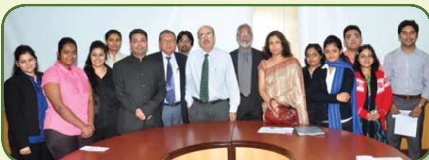
Students of MBA 2012 Batch gearing up with International Research Projects at Sussex University in International Finance, International Marketing and International Management