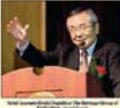
Dr Yuan Tseh Le speaking at the Children Science Congress.

Story of a Nobel laureate, in his own words Dr Yuan Tseh Le, the Chinese physicist who won the Nobel Prize in Physics in 1956, has shared his story in a book titled 'My Story'. The book is a collection of his personal experiences and insights into the world of science and the challenges of being a scientist. Dr Yuan Tseh Le was born in 1911 in Beijing, China. He studied at Tsinghua University and later at the University of Chicago. He was awarded the Nobel Prize in Physics in 1956 for his work on the quantum theory of the electron. Dr Yuan Tseh Le has been a leading figure in the field of quantum physics and has made significant contributions to the understanding of the electron and its interactions with light. He has also been a strong advocate for international cooperation in science and has worked to promote the development of science in China.